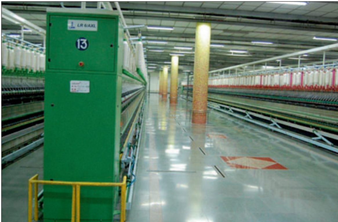
View of Spinning Plant at Bathinda