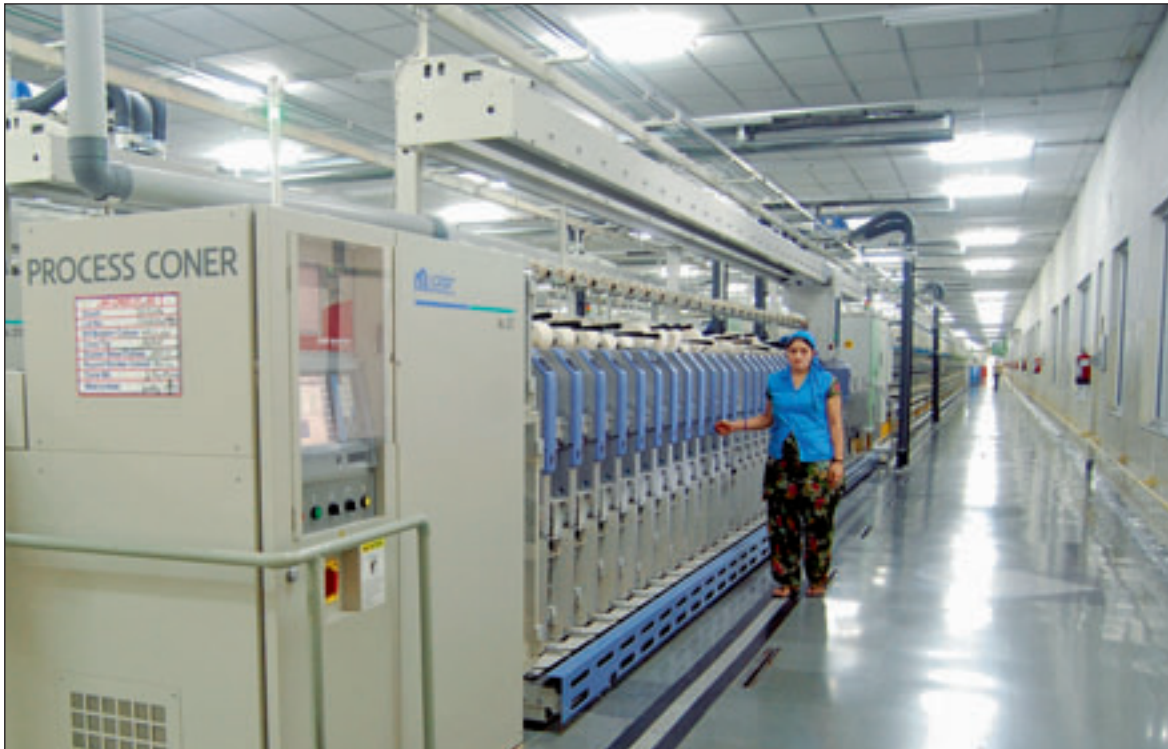
View of newly established Spinning Plant at Nalagarh (H.P.)